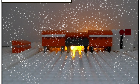
Arctic Station Napier.

Arctic Two, this is Napier. I have you on radar. You're almost here. Maintain present height, lights will be provided, over.